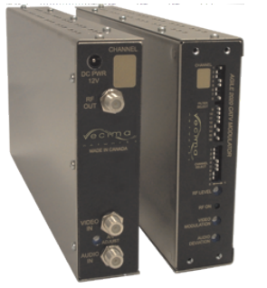
Vecima Networks Wavecom A2020 Analog CATV Modulator (comparable product is the Drake VMM860AG mini modulator)